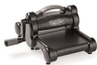
Big Shot [143263] $110.00