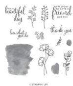
Love What You Do Photopolymer Stamp Set [148042] $21.00