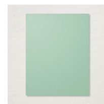
Mint Macaron 8-1/2" X 11" Cardstock [138337] $8.50