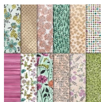
Share What You Love Specialty Designer Series Paper [146926] $27.00