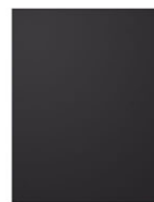
Basic Black 8-1/2" X 11" Card Stock [121045] $8.50