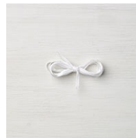
Whisper White 1/8" Sheer Ribbon [144172] $6.00